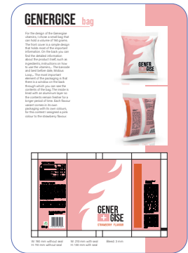
Bjarne Castelein, Belgium