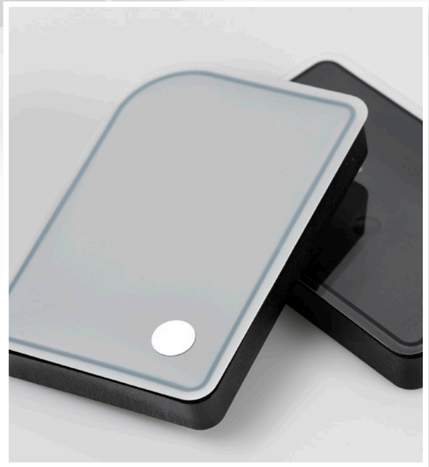
Schreiner Group GmbH & Co. KG, Germany

This group is designed to recognise new industry applications/ products (in the opinion of the judges) not covered by other groups, including innovative use or applications of the label press. This group also includes labels which incorporate integrated electronic devices which are not included in Group A6 – Security.