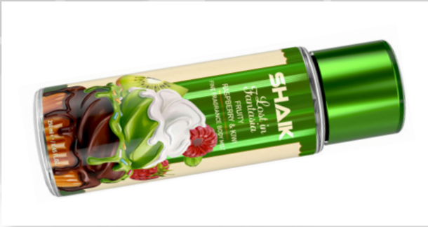
Çiftsan Label and Packaging Company, Turkey

The categories in this group are specific to a particular printing process. (Note: a maximum of 10% of the TOTAL AREA of the label can include another PRINTING process). Additional converting features including hot and cold foil, embossing etc. can be used without penalty. The judges will expect a high technical standard of printing and converting. Faults such as misregister will be penalised heavily.