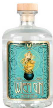
Ulrich Etiketten GesmbH, Austria