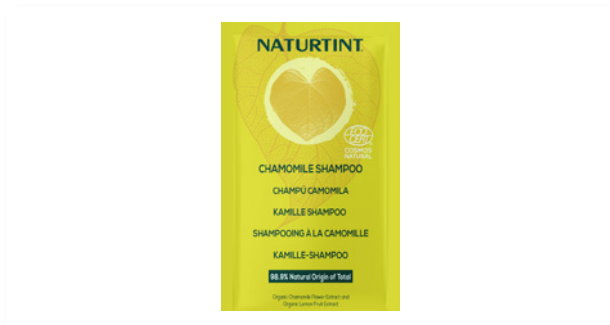
IPE Industria Gráfica, Spain

Design elements feature strongly in this group and will be considered as equally important as the technical printing/ converting procedures.