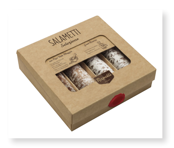
A11 - Helvetikett Flexible haptical wax seal

Chianti Docg Orange Winter Limited Edition 75 cl Screen Freakshow Cabernet Sauvignon Litho