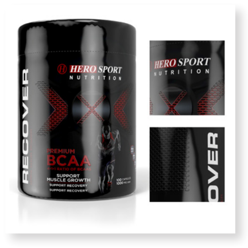
C1 - Ciftsan Hero Sport Recover