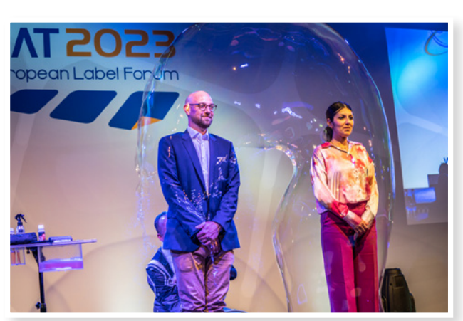
The Ulrich Etiketten team is enveloped in a bubble