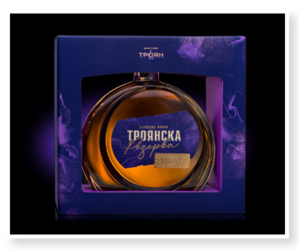
A2 - Dars Troyanska Golden Reserva