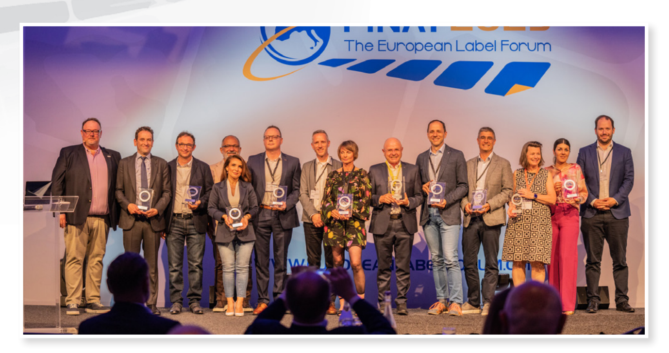
All category winners in Group A: Marketing/End-Uses

year, in Vienna. The winning entries were again displayed during the entire event after the Awards Ceremony and will also be shown at Labelexpo Europe 2023 in Brussels.