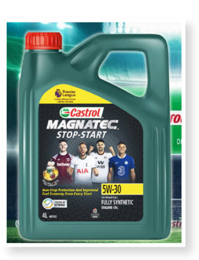
A8 - Kimoha Castrol Magnatec Stop-Start 5W-30

Helvetikett flexible and haptical wax seal label with tamper evident function Flexo Helvetikett customized unique VOID label Natco Pharma Cesiral Verification Label