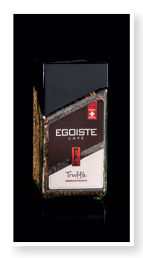
A4 - Carini Egoiste