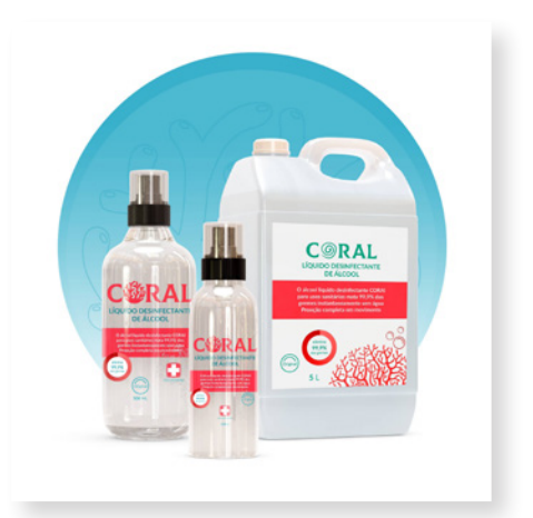
B3 - Ciftsan Coral liquido desinfetante