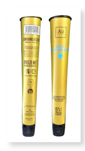
C3 - Stratus Frozen Ice Pop Blue Raspberry Vodka