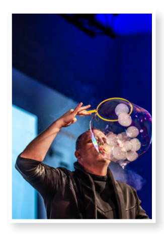
A performance of the BubbleMan