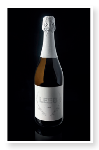
A1 - Carini- LEEB Flair

Pragati Pack (India) Pvt. Ltd. Tèrchu Spring Mineral Water Flexo