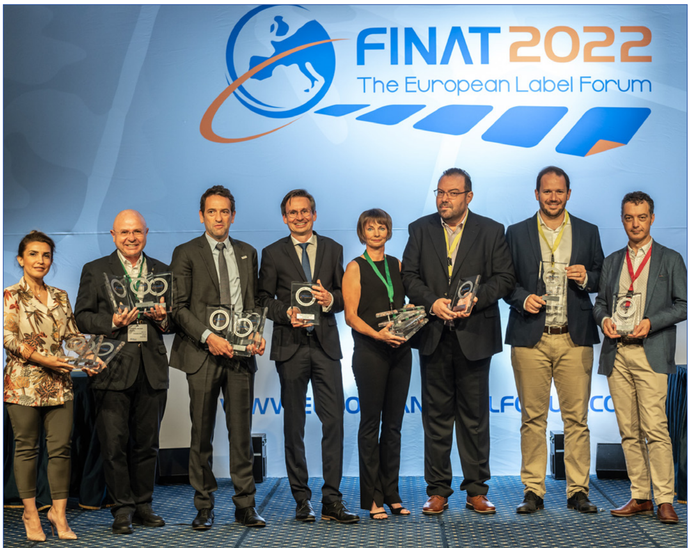
Awards Ceremony 2022