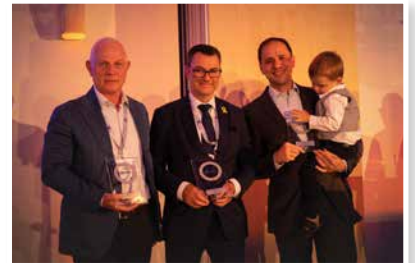
Group E Category winners