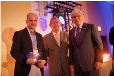
Group C winner Fortlabels Greece