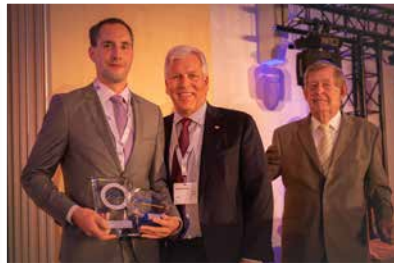
Group D winner Schreiner Group Gemany