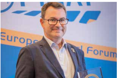
Group E winner Germark Spain