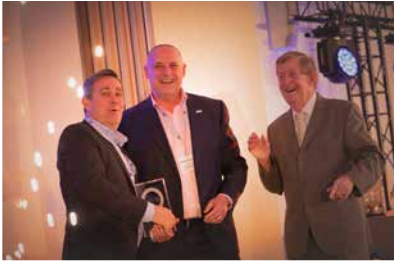
Best in Show winner MCC Chile represented by MCC Cwmbarn