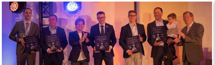
WLA 2018 FINAT winners