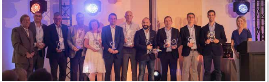
Group A category winners