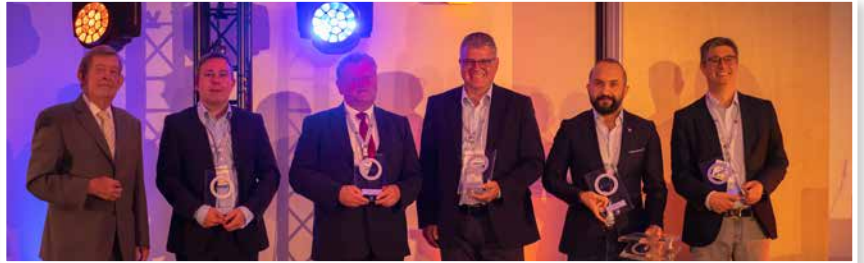
Category B category winners